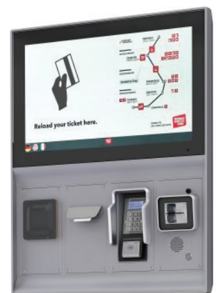
Axess TICKET FRAME 600