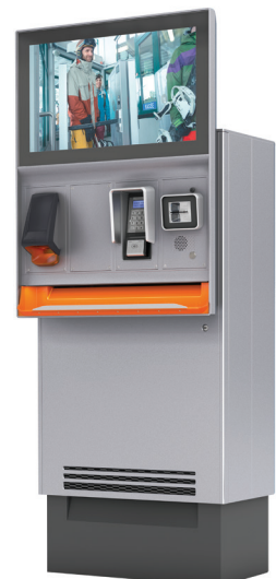
Axess TICKET KIOSK 600