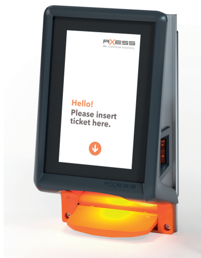
Axess SMART SCANNER 600