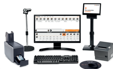
Axess SMART POS

installed, as well as 7 Axess HANDHELDS. Thanks to the easy-to-configure software, the visitor management system can be easily adapted to the needs of