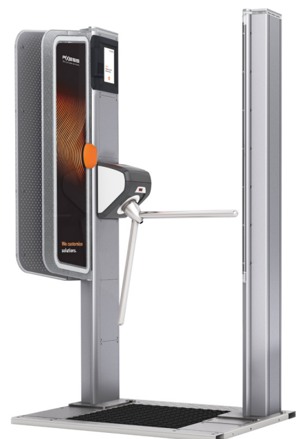
AX500 Smart Gate NG - Turnstile

In addition, Axess SMART POS is implemented on the Tech Desk for the payment of rental fees. The store employees have all the necessary customer's data and a real-time overview to the rental store's inventory. The smart software enables operators to