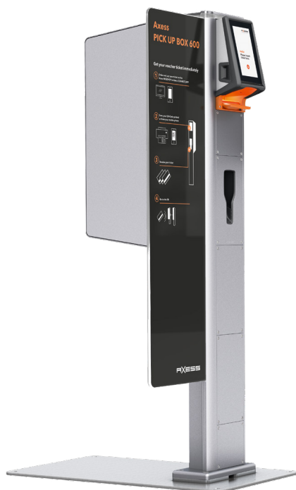
AX500 Smart Gate NG

After a successful purchase process, the guest receives a digital ticket with a QR code. Once at the Myler Resort, the guest scans the QR code of the ticket - either from the smartphone or Print@Home ticket - at the Axess PICK UP BOX 600 , issuing the ticket in a matter of seconds which the ski guest then stows in his jacket pocket.