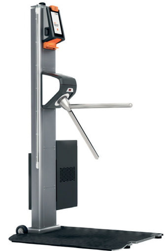
AX500 Smart Gate NG NFC AKKU Mobile Palette