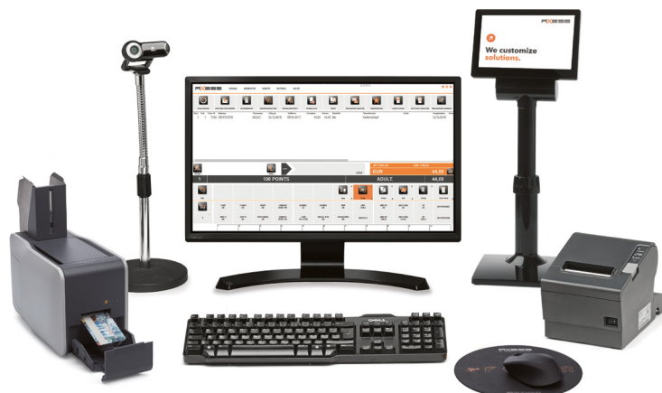
Axess SMART POS