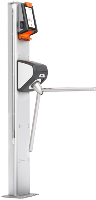
AX500 Smart Gate NG - Turnstile

14 AX500 Smart Gates NG Turnstile and 10 AX500 Smart Gates NG Flap ADA were installed at the entrance for quick and contactless access to the ruins.