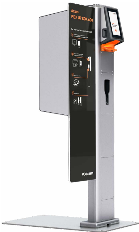
Axess PICK UP BOX 600

Equipped with the Flap module, skiers can pass through the gates barrier-free and without any obstacles. The integrated long-range antenna identifies the RFID ticket in a fraction of a second; if the ticket check is positive, the gate opens and the guest can pass through it without contact. Thanks to the latest ropeway technology and innovative access control, guests can now follow in the footsteps of the Olympic legends even faster.