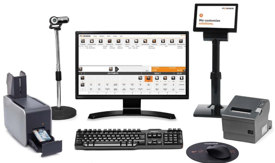
Axess SMART POS