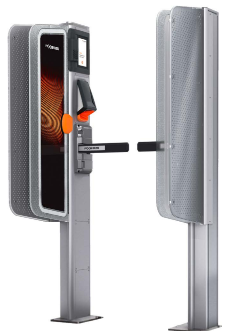
Axess Smart Gates NG - Flap

The Tyrolean ski resort has already been equipped with Axess Smart Solutions for the past five years. At all lifts, access is controlled by AX500 Smart Gates NG . The flexible gates can be individually adapted to customer needs and also modified at a later date. Whether turnstile or motor-supported flap modules, all options are open. Due to the modular design, new and existing gates can be extended by additional modules at any time, for example with the Axess CONTROLLER 600 or Axess TICKET SCANNER 600 .