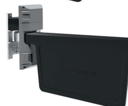
Flap Paddle ADA