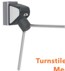
Turnstile Panic Mechanic