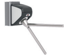
Turnstile Panic Asymmetric