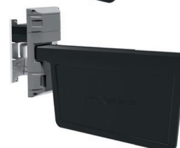
Flap Paddle ADA