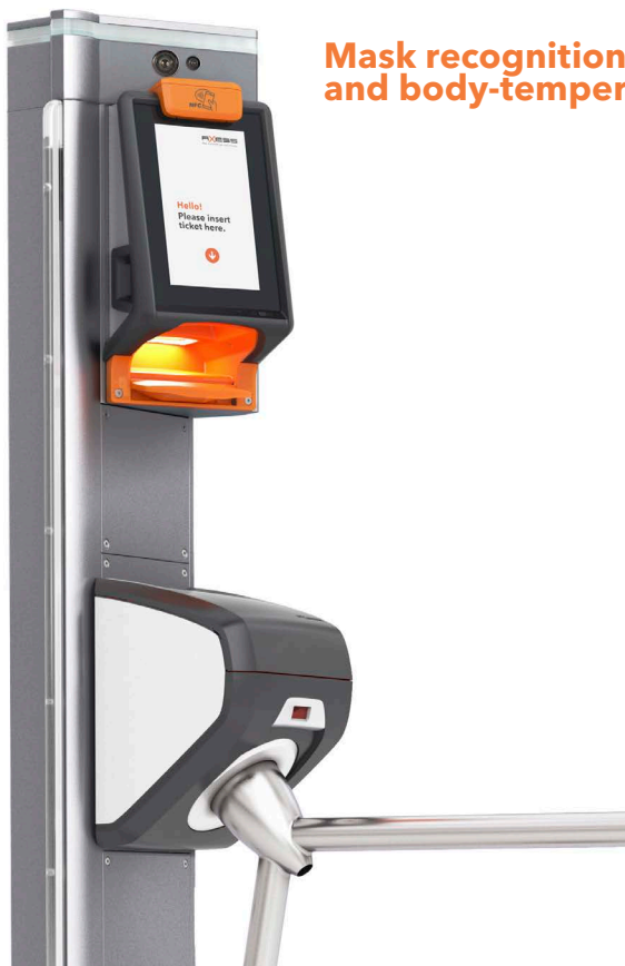
Mask recognition and body-temperature scan

more smart developments are done in house and guarantee best integration into the systems and best support when it comes to customizing solutions.