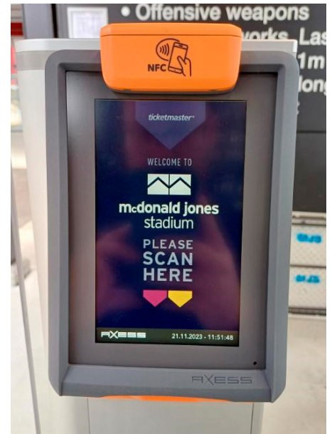
Axess SMART SCANNER 600 NFC

Cheers to a year of triumphs and many more to come!