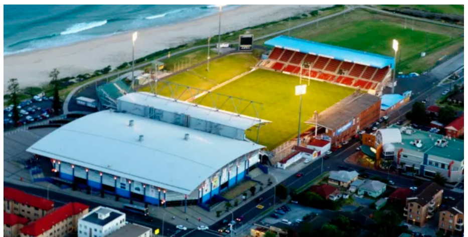
WIN Stadium, Wollongong, NSW