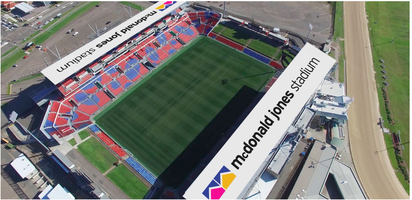
McDonald Jones Stadium, Newcastle, NSW

Stadium the pioneer Venues NSW site to adopt Axess technology.