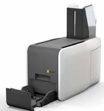
Axess SMART PRINTER 600