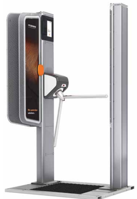
AX500 Smart Gate NG

"Considering the long-term development, it is necessary to create a data pool for analyzing daily passenger flows, sales data and product data to facilitate