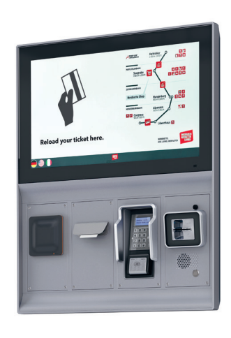
Axess TICKET FRAME 600