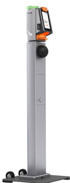
Axess SMART POST 600