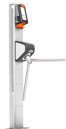
AX500 Smart Gate NG – Turnstile

also be read contactlessly in addition to NFC wallets. A future-proof system with advantages that Daniel Däuper, responsible for ticketing at SC Freiburg, explains in more detail in the interview.