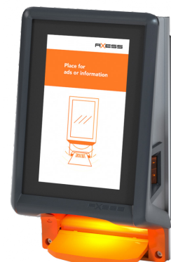
Axess SMART SCANNER 600 NFC