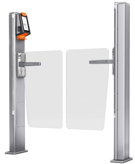
AX500 Smart Gate NG FLAP 600 Glass ADA

by one person, a separate QR code is generated for each guest. This can either be scanned from one smartphone or the corresponding QR codes can be shared to your family & friends. Possible waiting times at the cash desk can therefore be avoided in a simple way.