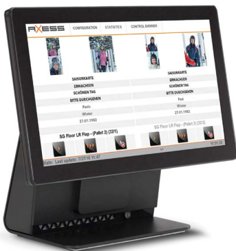
AX500 Lane Control Monitor